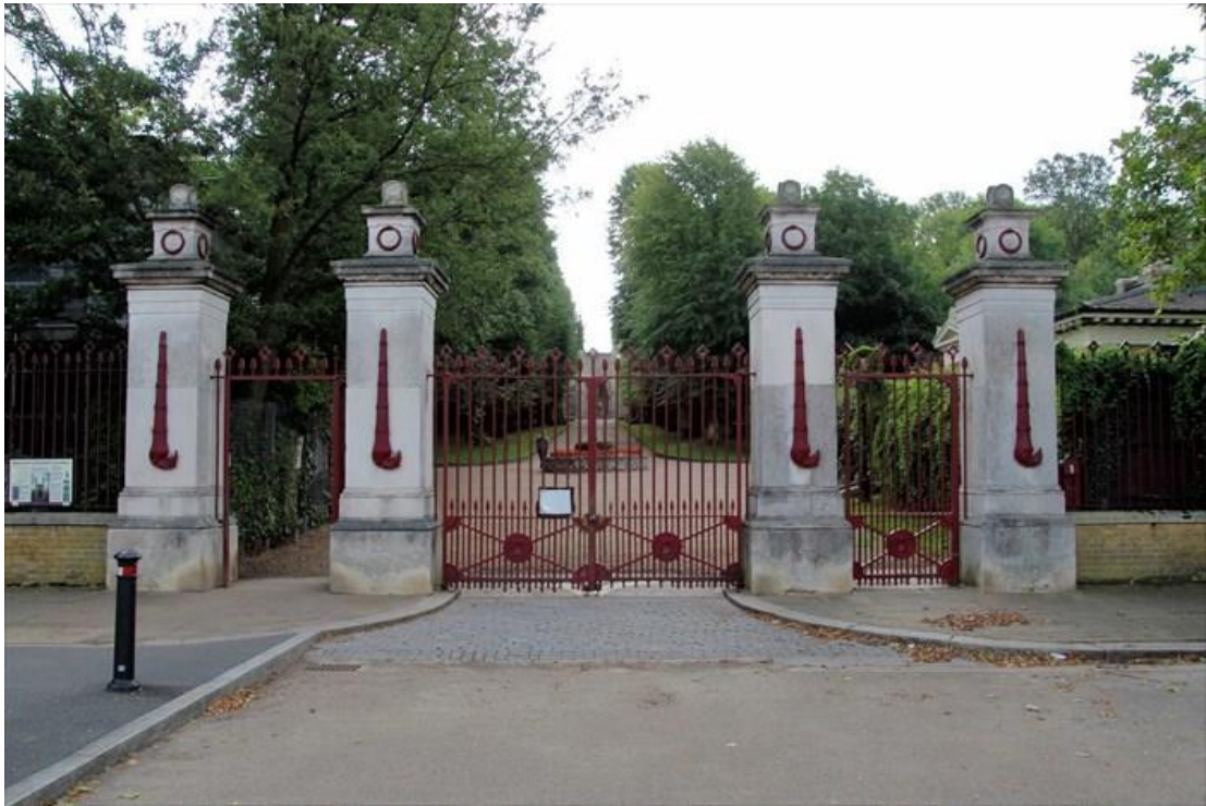
All Saints Cemetery, Nunhead