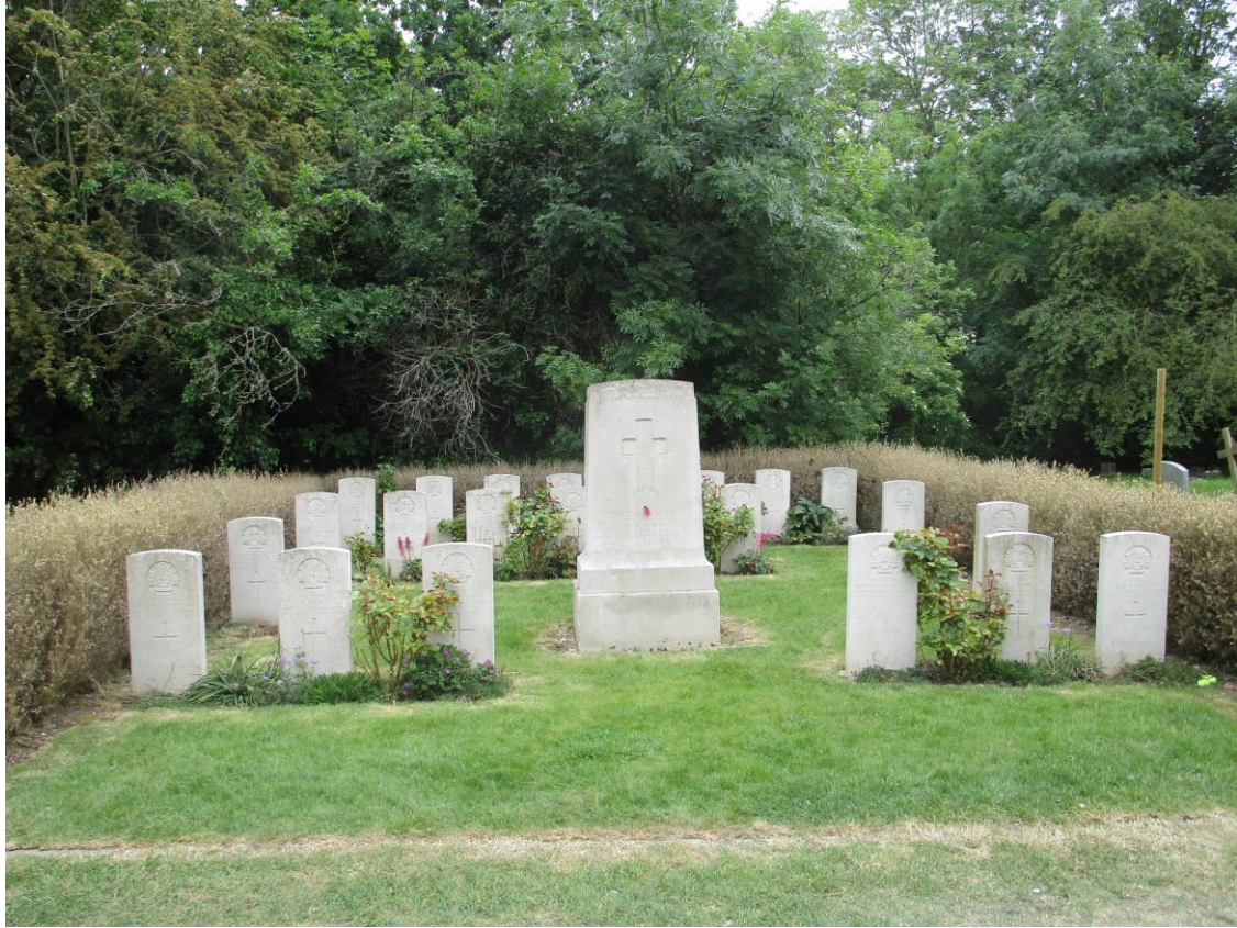
Australian War Graves in All Saints Cemetery, Nunhead